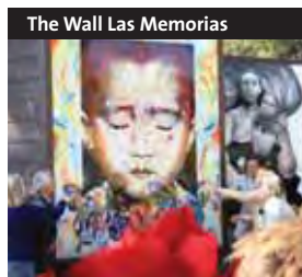
The Wall Las Memorias